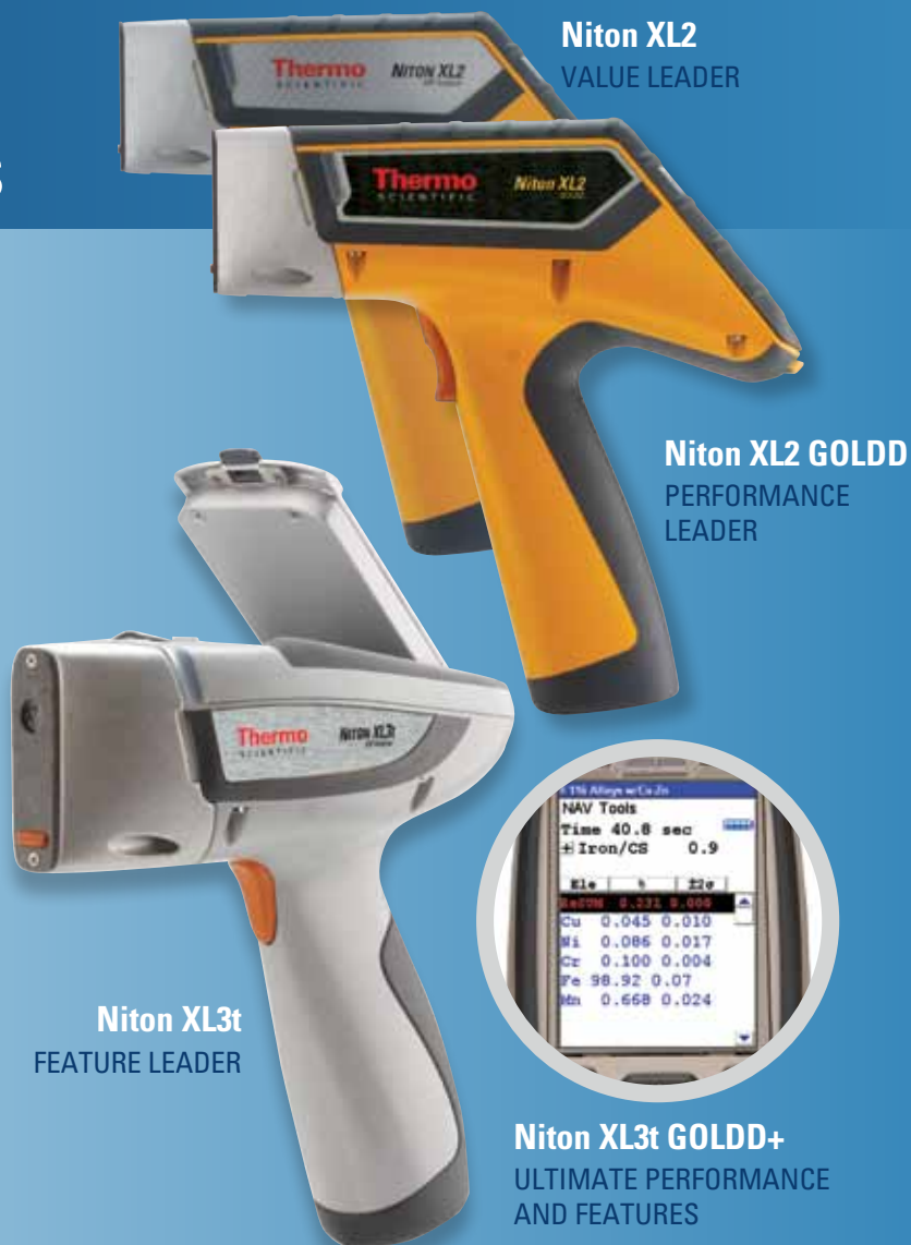
Niton XL2 VALUE LEADER